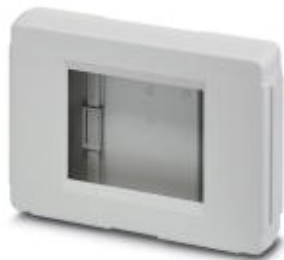
Display housing, 5.7", light gray, central window, front level, consisting of two half shells, four front plates with screws

Please be informed that the data shown in this PDF Document is generated from our Online Catalog. Please find the complete data in the user's documentation. Our General Terms of Use for Downloads are valid ( http://phoenixcontact.com/download )